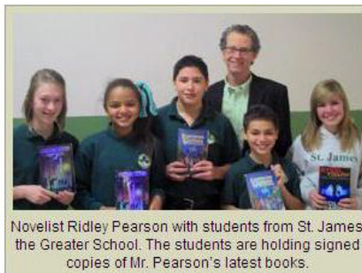
Novelist Ridley Pearson with students from St. James the Greater School. The students are holding signed copies of Mr. Pearson's latest books.

In preparation for his visit, St. James students read two Ridley Pearson novels for young adults – The Kingdom Keepers and Steel Trapp . Students discussed the content of these books with the author during a question and answer session. At the conclusion of the event, Mr. Pearson signed each child's book.