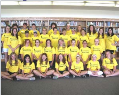
--Kennedy Catholic High School "Camp Lead" Participants

St. James the Greater and Valle Catholic Students Excel in Science Fair