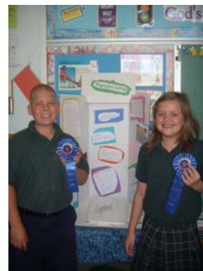
--St. James the Greater students show off their ribbons

*The Discovery Award is given to the top 10 percent of the projects judged and qualifies the students to compete in the National competition. (More pictures below in blue column...)