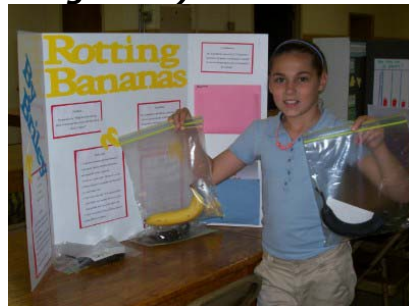
--Valle Students show off their winning projects (More pictures below in blue column...)