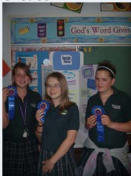
Science Fair Winners